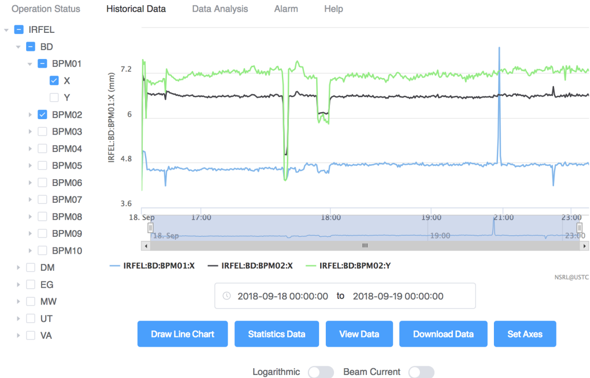
Figure 3: Screenshot of the Web-Based GUI.

end. The design of the complete separation of the front and back end is also convenient for future expansion, like adding new data types and adding new methods for interaction with users.