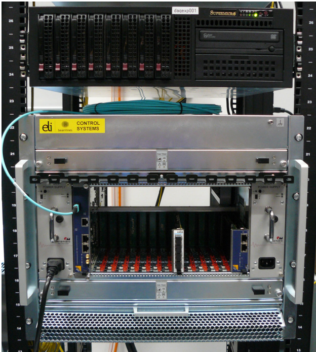
Figure 3: Connection between MTCA and PC based system.

(shown in Fig. 3) provides PCIe x16 interface and can be implemented using PCIe on MTCAs' agnostic backplane and its fat pipes.